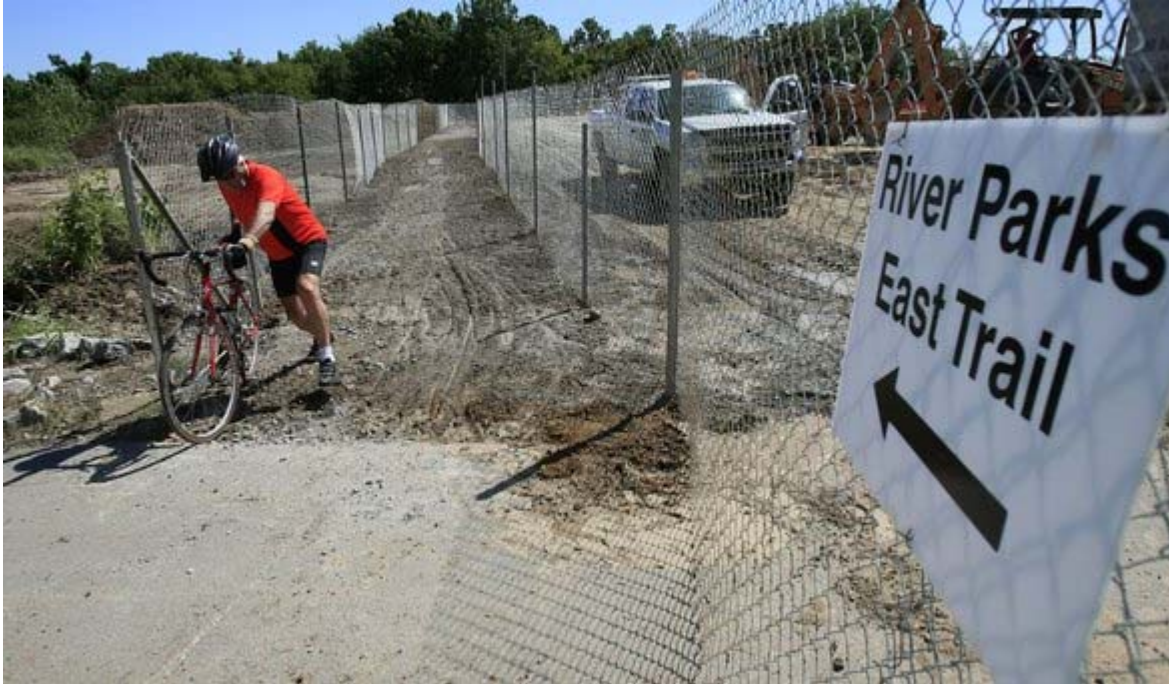
Cyclist Sam Naifeh walks his bicycle past a muddy area on a temporary path around construction at the Turkey Mountain trail. STEPHEN HOLMAN / Tulsa World

Copyright © 2009, World Publishing Co. All rights reserved